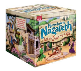
HOMETOWN NAZARETH-1 KIT

Session 5 - Women Find the Empty Tomb (Luke 24:1-12)