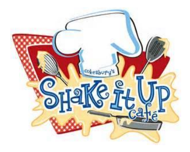
SHAKE IT UP CAFÉ-5 KITS

Session#5 Paul Delivers Good News- (Acts 27)